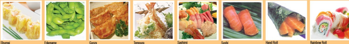
Shumai Edamame Gyoza Tempura Sashimi Sushi Hand Roll Rainbow Roll