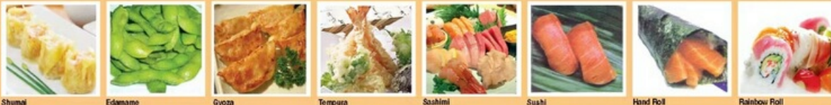
Shumai Edamame Gyoza Tempura Sashimi Sushi Hand Roll Rainbow Roll